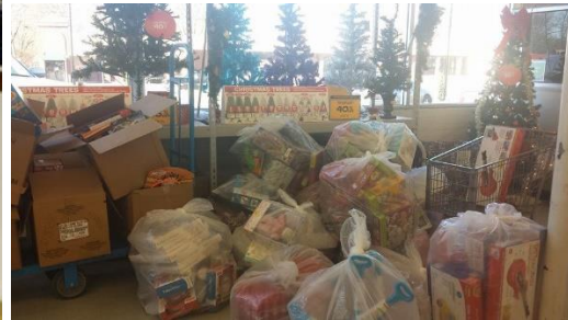
Multiple painting classes with proceeds donated to Kops Kids. Items purchased and collected for distribution